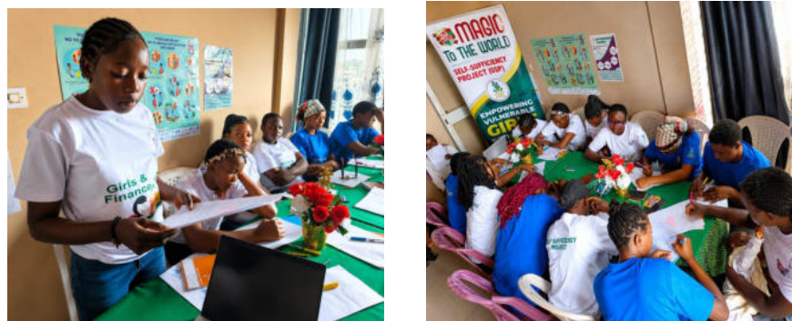
Fig 1: Mentorship Session 1. Interactive sessions with the AGYW.