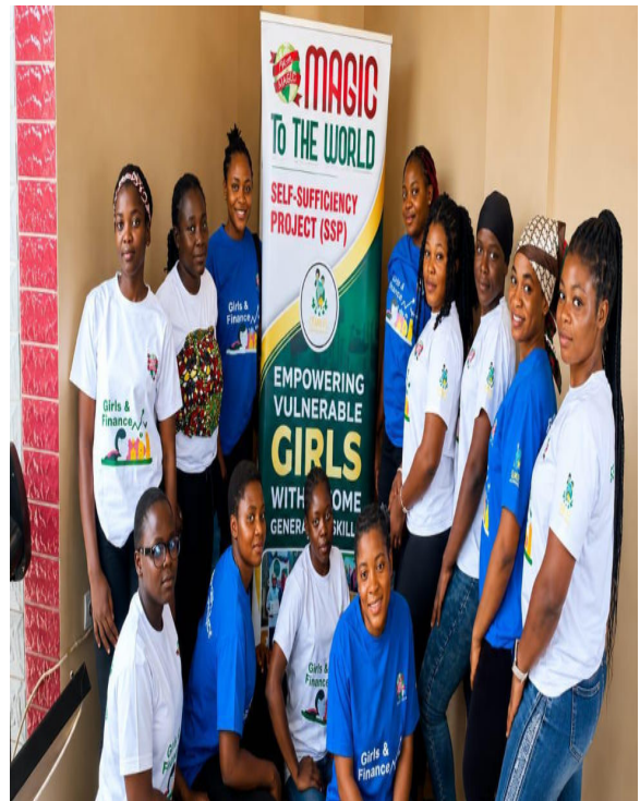
Venue: SWO Office Space