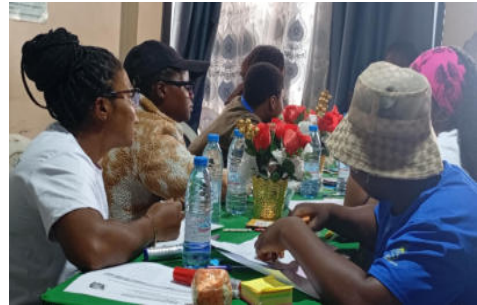
Fig 2: Week Two Session Activity