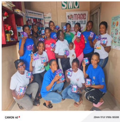
Fig 4: Pictorial View of Week 3 Of the coaching Session on social media and Menstruation